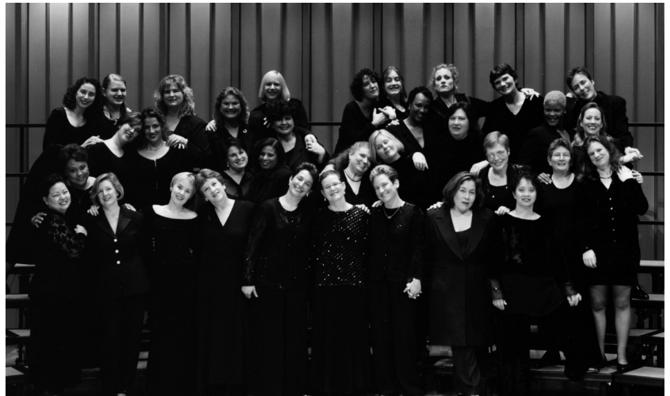
VOX Femina, 2000-2001

+ denotes Founding Member ** denotes Current Singer