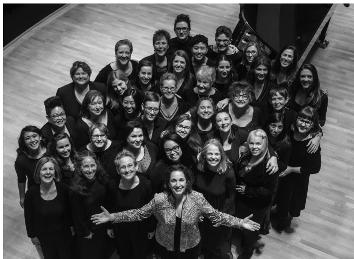
VOX Femina, 2018