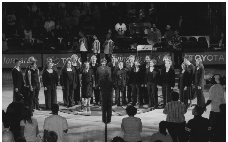
VOX Femina at the LA Sparks, 2009-2010