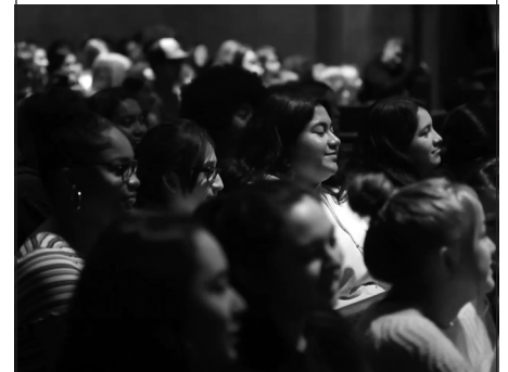
Concert for Youth, 2019