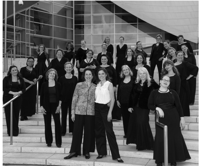
VOX Femina Los Angeles at Disney Concert Hall, 2017