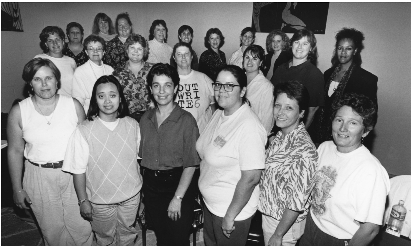
VOX Femina Founding Members, 1997