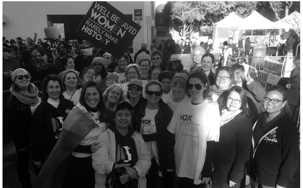
VOX Femina at the 1st Annual Womens March - Downtown LA, January 2017