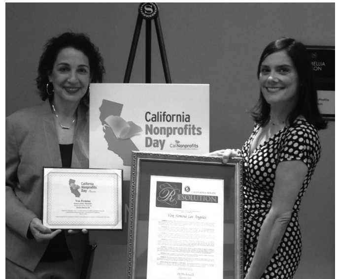
California Nonprofit of the Year Award, 2016